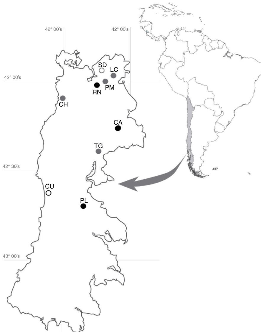
Fig. 1. Map of Chiloé, showing the studied localities. Glaciogenic peatlands: PL, Púlpito; RN, Rio Negro; CA, Caulles. Anthropogenic peatlands: SD, Senda Darwin; CH, Chepu; PM, Pumanzano; LC, Lecam; TG, Teguel. Tepuales: SD, Senda Darwin; CU, Chiloé National Park.

and in tropical belts throughout the world (Fig. 3A). When a more detailed analysis of habitat preference by organism type is done, the dominance of species endemic to southern South America reappears as a pattern.